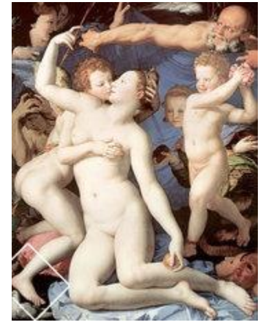
The famous Python Foot can here be seen in its original format in the bottom left corner of "An Allegory of Venus and Cupid" by Bronzino (~1545)

When Monty Python had no ending for a skit, this foot would appear out of the sky and squash whatever was on screen with a rude noise. Allowing the show to move on.